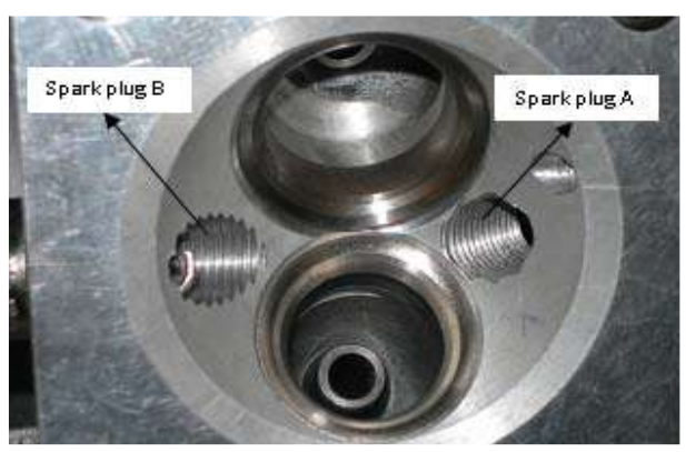
Details of spark positions in a DTS-i engine<sup>[3]</sup>.

The actual picture of Bajaj Pulsar Bike is - Moreover, such a system can adjust idling speed & even cuts off fuel feed when the accelerator pedal is released, and meters the enrichment of the air-fuel mixture for cold starting and accelerating purposes; if necessary, it also prevents the upper rev limit from being exceeded. At low revs, the over boost is mostly used when overtaking, and this is why it cuts out automatically. At higher speeds the over boost will enhance full power delivery and will stay on as long as the driver exercises maximum pressure on the accelerator.